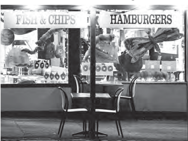
☆ Maldon Takeaway’s winning display of The Very Hungry Caterpillar .

SEVENTEEN businesses joined in the fun of decorating their shop fronts with this year’s theme of children’s books. The grade six students from Maldon Primary School took their judging duties very seriously and were seen studying the